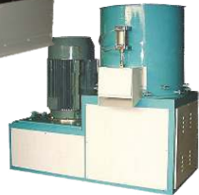
▲ Pet Recycling Plants