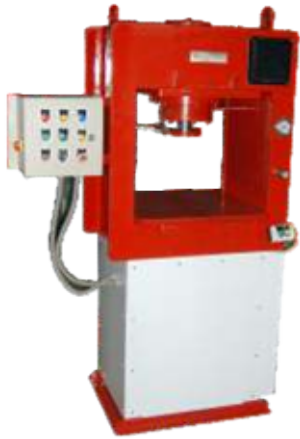
▲ Hydraulic Press for Pack Assembly & Dismantling