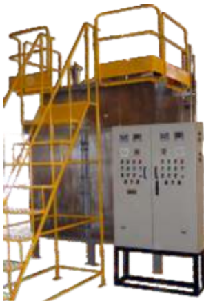
◀ Solvent (TEG) Steam Hydrolysis Cleaning Systems