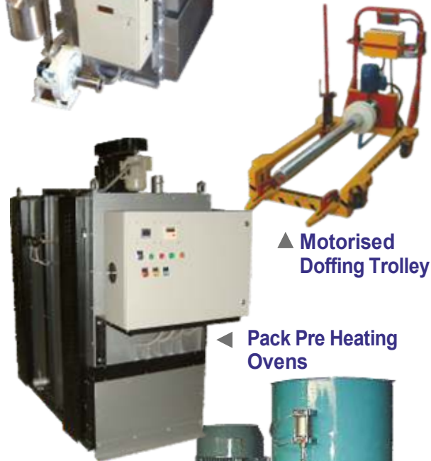
▲ Motorised Doffing Trolley