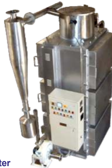
◀ Fluidised Bed Cleaning System Extruder Screw, Spin-pack & Spinneret