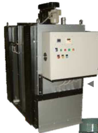
◀ Pack Pre Heating Ovens