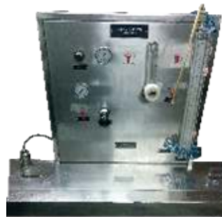
▼ Bubble Point Tester