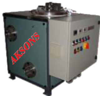
▲ VACUUM OVEN