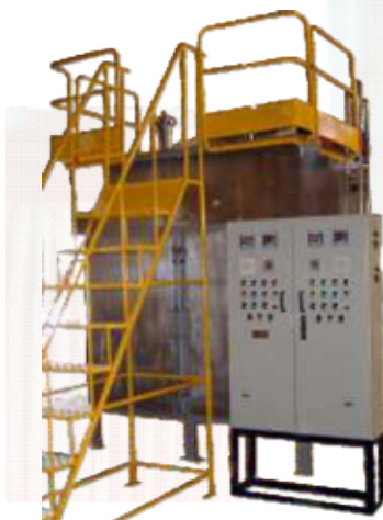
Solvent Cleaning System